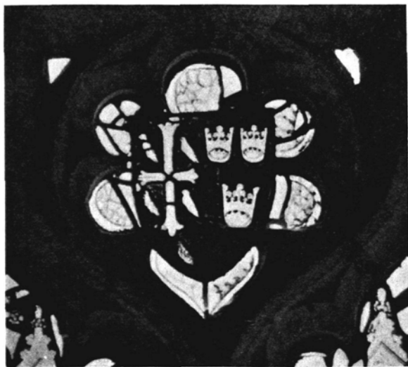
PLATE III. WESTWELL CHURCH, KENT. Detail of arms in window shown in Plate I.