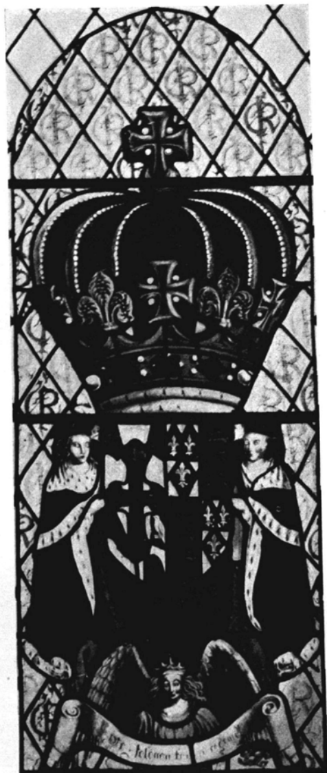
PLATE V. WATERINGBURY CHURCH, KENT. Panel in window shown in Plate IV.