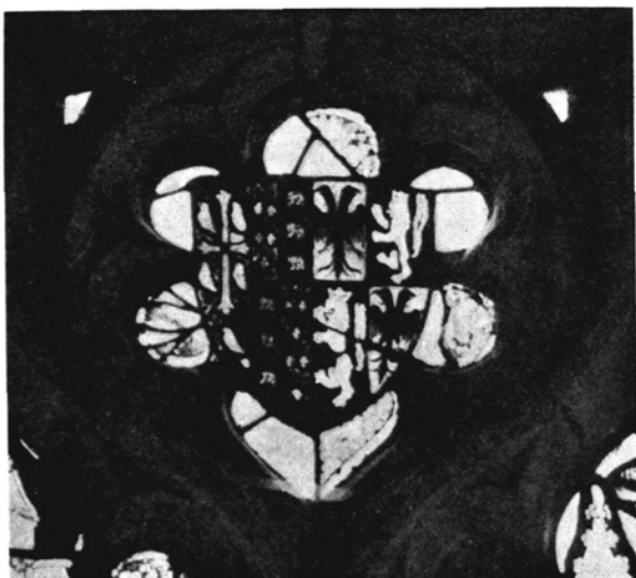
PLATE II. WESTWELL CHURCH, KENT. Detail of arms in window shown in Plate I.